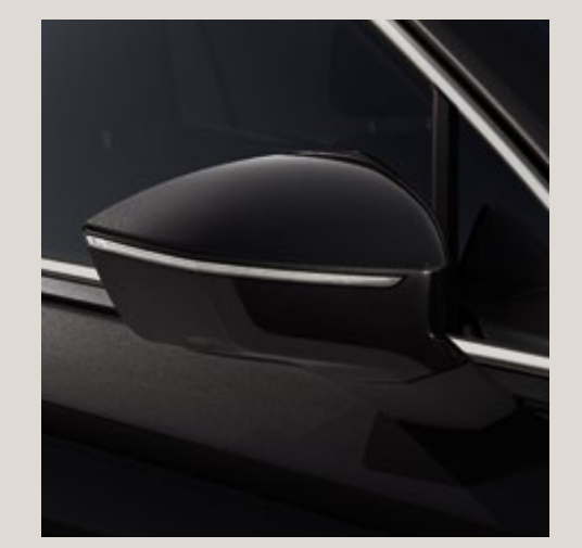
Deep Black<sup>2</sup> SE SETECH XC XCL FR FRS

Urano Grey<sup>1</sup> SE SETECH XC XCL FR FRS