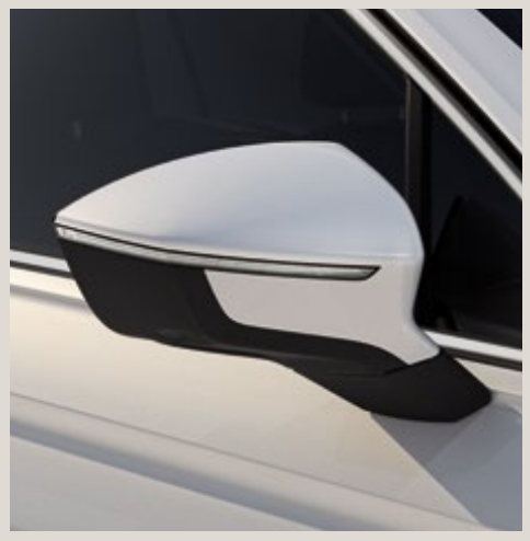
Oryx White<sup>2</sup> SE SETECH XC XCL FR FRS