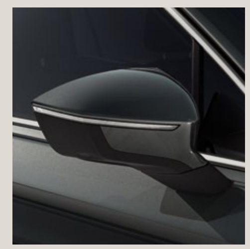
Dark Camouflage<sup>2</sup> SE SETECH XC XCL FR FRS