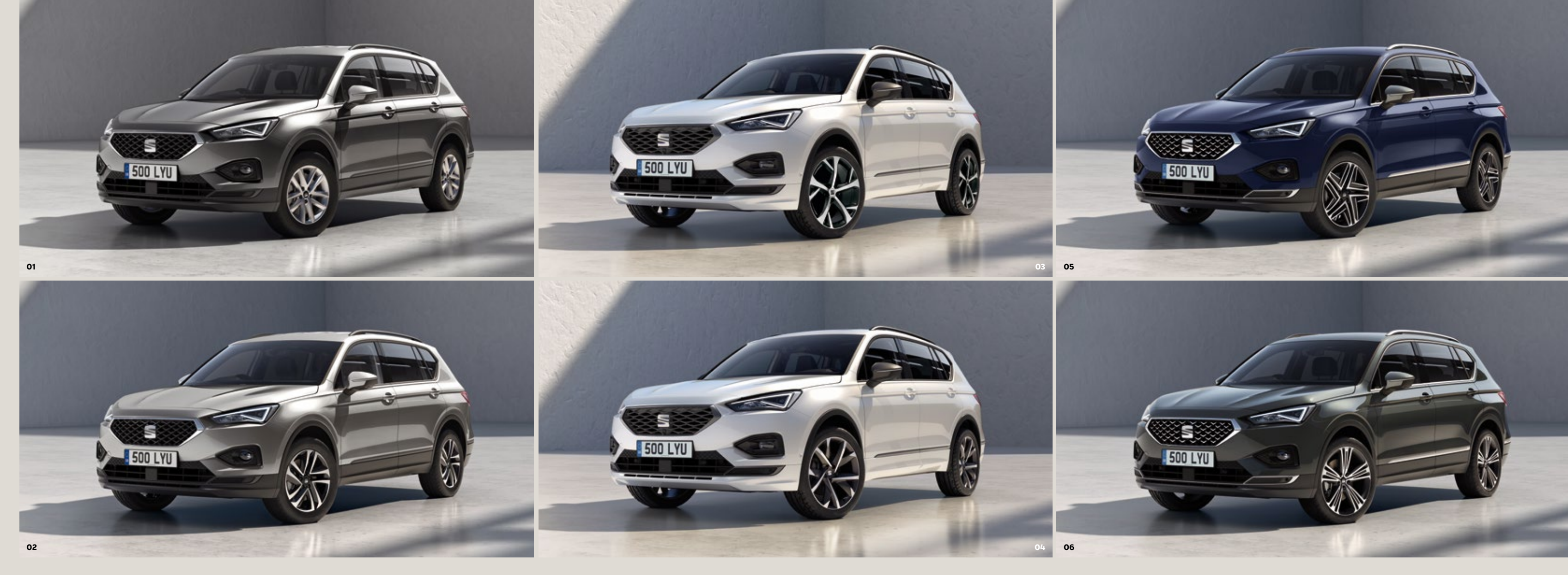
01 SE. The Essential One.