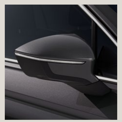
Indium Grey<sup>2</sup> SE SETECH XC XCL