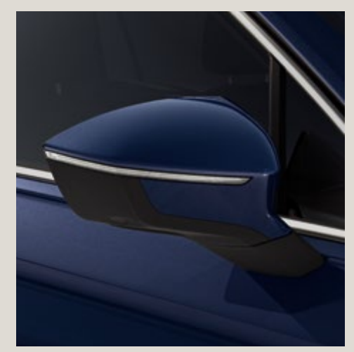
Atlantic Blue<sup>2</sup> SE SETECH XC XCL