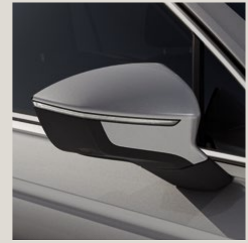
Reflex Silver<sup>2</sup> SE SETECH XC XCL